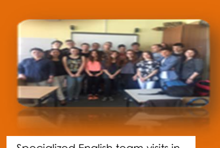
Specialized English team visits in a local school in Poland.

In order to increase the students' knowledge of English, students, working in pairs, must submit a joint project. The project has several stages: choosing one or more current articles in English out of valid scientific databases, analyzing the articles, comparing them and presenting the project to the class – all in English.